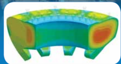
An example of a mold flow analysis image.

Our 55,000-square-foot R&D facility enables complete materials research, development and testing for elastomers and plastics.